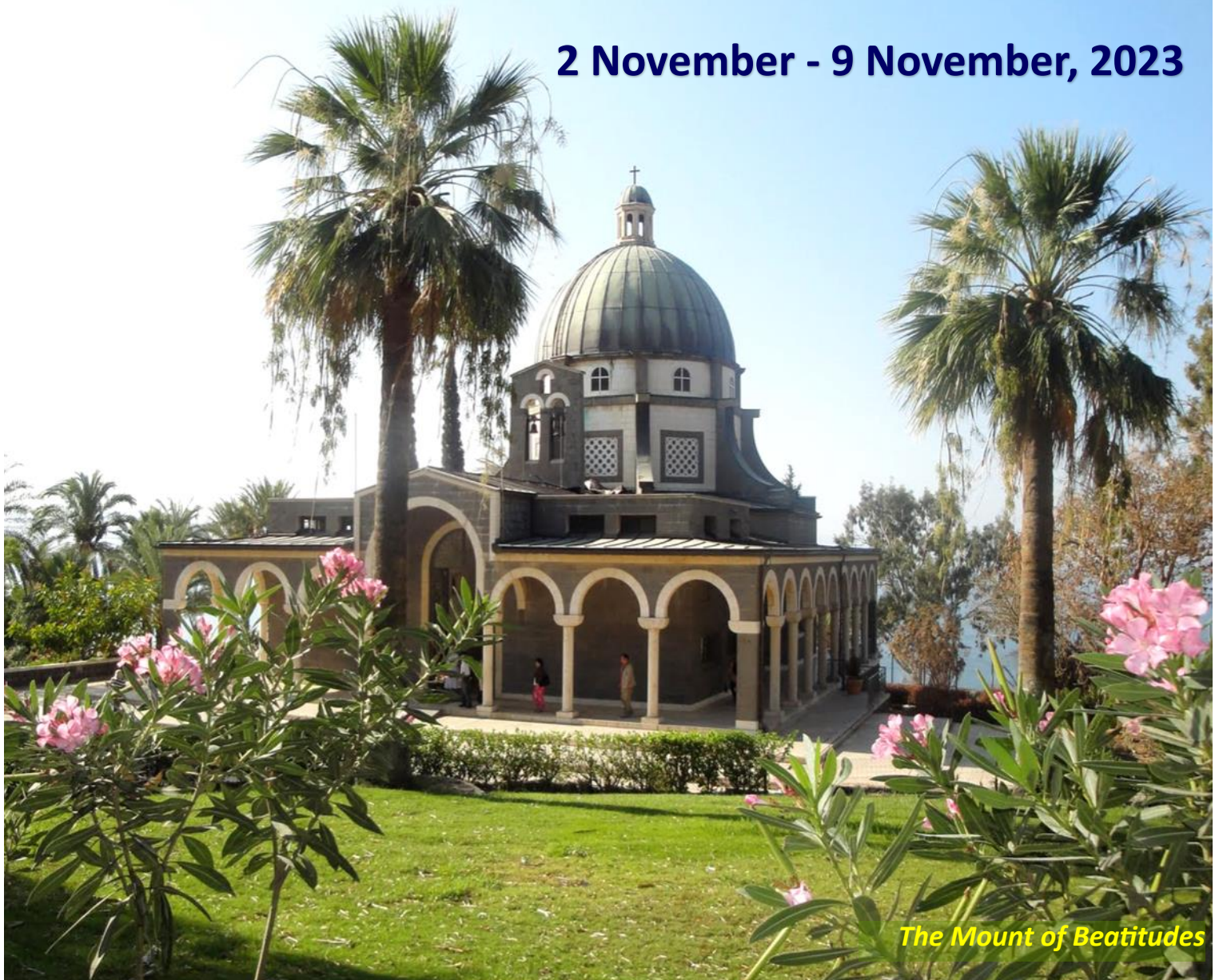
The Mount of Beatitudes