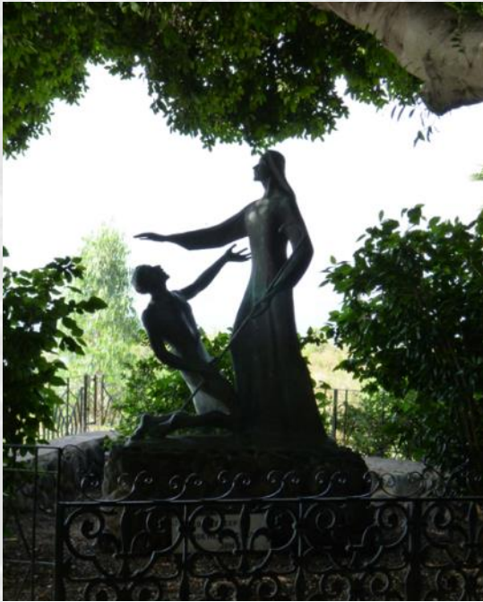
Church of Peter Primacy

We begin our day with a short drive or walk to the Church of the Multiplication at Tabgha, followed by a visit to the Church of Peter Primacy, the scene of Jesus's lakeside resurrection appearance. We then drive up to the summit of the Mount of Beatitudes with its amazing views over the Sea of Galilee and the countryside where Jesus lived and ministered. After a break for lunch we visit ancient Capernaum, the centre of Jesus's Galilean ministry. We will sail in a contemporary version of the boats used 2,000 years ago, and see the remarkable remains of a historic boat recovered from the lake which dates to the first century CE. We return to our hotel for dinner and overnight stay.