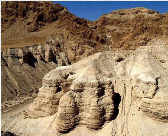
The Qumran Caves

We begin our day with an optional visit to the Church of the Nativity (06:00) to avoid the crowds and return to our hotel for breakfast. This morning – if the political climate permits - we experience both the huge depth of religious history in the Holy Land and its modern-day problems. We visit Hebron, site of the Tombs of the Patriarchs and see how the Old City centre has been divided and impoverished by the Occupation. Hebron glass is famous and we will also visit a glass factory and a weaving factory where the famous Palestinian 'keffiyeh' headdresses are made before breaking for a lunch. In the afternoon we drive down to the Dead Sea and visit Qumran where the Dead Sea scrolls were found. We also visit the excavations of an Essene community, from where the scrolls probably originated. We will also have an opportunity to bathe (or float!) in the unique mineral-laden waters of the Dead Sea before returning to Bethlehem. Dinner and overnight stay in Bethlehem.