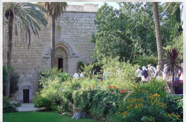
The Benedictine Monastery at Abu Gosh

After a leisurely breakfast we leave Jerusalem and drive west towards the Mediterranean and the airport, stopping at the town of Abu Gosh, one of the possible sites of the Biblical Emmaus, to celebrate a final Eucharist with the hospitable religious community there. We will have an early lunch before heading to the airport for our flight home arriving back at London Heathrow in the late evening.