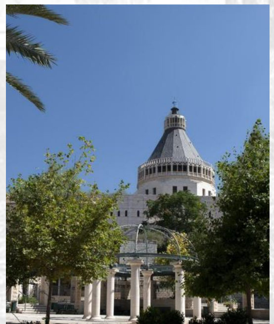
The Basilica of the Annunciation

After breakfast we drive across the Jezreel Valley and the biblical scene of Armageddon to Mount Tabor and ascend to the summit to visit the Church of the Transfiguration and celebrate the Eucharist. On descending Mount Tabor we drive over to Nazareth, the town where Jesus grew to adulthood. After a break for lunch we will begin our tour by visiting the Basilica of the Annunciation and the Synagogue-Church (where the "Nazareth Manifesto" was proclaimed). Late afternoon return to our hotel in time for dinner and overnight stay.