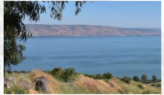
The Sea of Galilee

We gather at London Heathrow Airport for our morning flight to Tel Aviv. Lunch will be served in-flight. On arrival we are met by our guide and then travel north to our hotel on the shore of the Sea of Galilee. Overnight stay overlooking the Sea of Galilee.