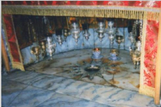
Reputed birthplace of Christ within the Church of the Holy Nativity, Bethlehem