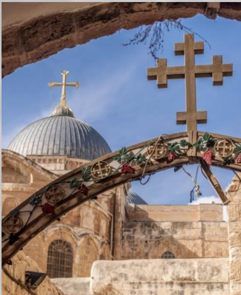
Church of the Holy Sepulchre

Early rise! We begin our day with an optional visit to the Church of the Holy Sepulchre (06:00) to avoid the crowds and return to our hotel for breakfast. After breakfast we drive around to the Lion Gate, also known as St. Stephen's Gate and re-enter the Old City to visit the Pools of Bethesda and the beautiful Crusader Church of St Anne (the mother of the Virgin Mary). We continue our way up to the Ecce Homo Arch and begin our walk along the Way of the Cross, through the narrow streets of the Via Dolorosa. These culminate in the extraordinary Church of the Holy Sepulchre, built over the site of Jesus's crucifixion, burial and resurrection. Break for lunch. Our last afternoon will be free to explore the Old City and revisit sites of particular interest. Farewell dinner and overnight stay in Jerusalem.