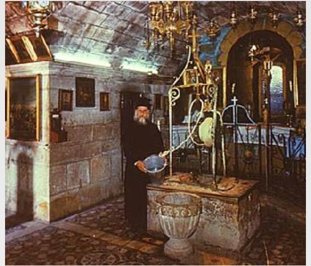
Jacob's Well, Nablus

We make an early start and head south through the heart of the occupied West Bank. We pause in the Palestinian city of Nablus (the Biblical Shechem). Here we will visit Jacob's Well, where Jesus encountered a Samaritan woman drawing water. We then drive down the Jordan Valley to the site believed to be close to where Jesus was baptised by John and where we will have an opportunity to renew our baptismal vows. We then journey to the nearby oasis city of Jericho, the city of palms, for lunch and a view of the Mount of Temptation. We will also stop at the sycamore tree traditionally (very traditionally!) associated with Zacchaeus. In the late afternoon we drive up through the Judean Wilderness towards Bethlehem and enroute visit Herodion, a fortress built by Herod the Great. This monumental fortress and palace complex stands on the highest hill in the Judean desert and is where Herod was laid to rest. We then enter through a check-point in the massive 9-metre high separation wall and check-in to our hotel. Dinner and overnight stay in Bethlehem.