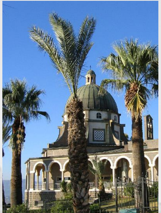
Mount of Beatitudes