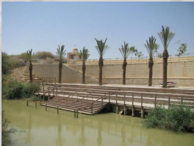
Qasr el Yahud baptism site