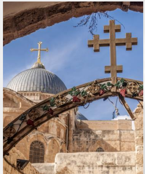
Church of the Holy Sepulchre