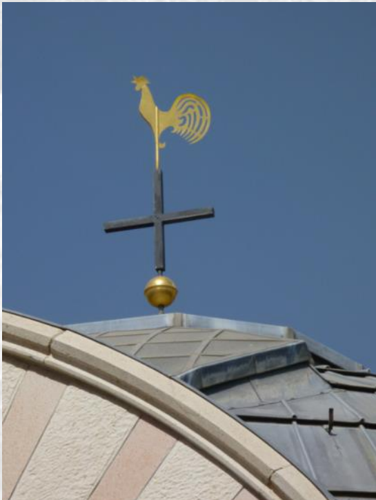
Church of St. Peter in Gallicantu

Returning to Jerusalem in good time for dinner and overnight.