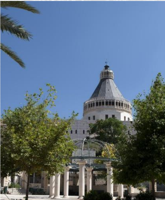
The Basilica of the Annunciation