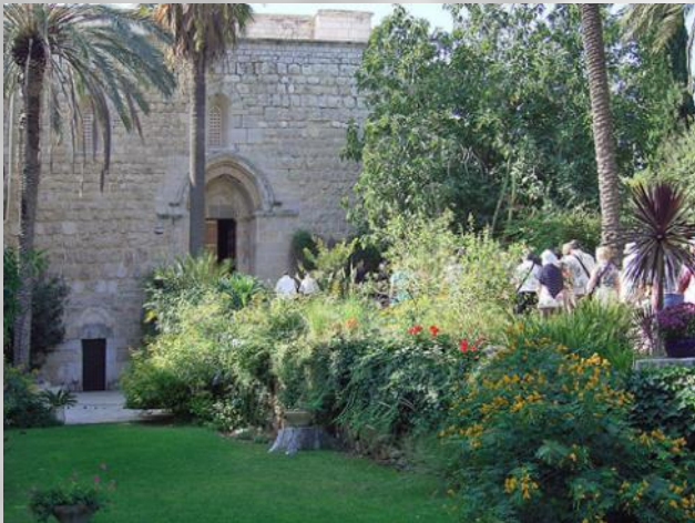
The Benedictine Monastery at Abu Gosh