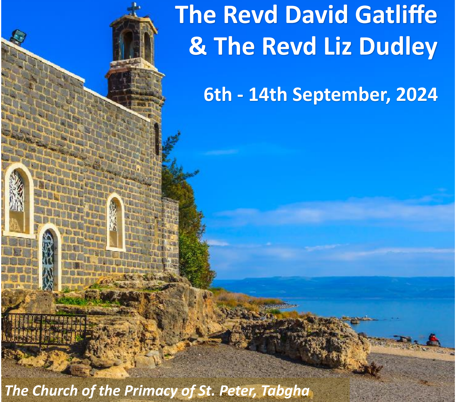
The Church of the Primacy of St. Peter, Tabgha